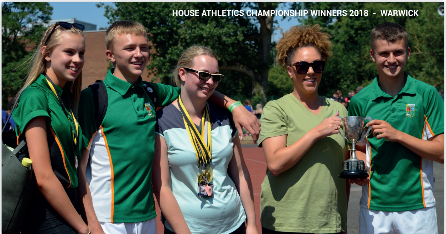
HOUSE ATHLETICS CHAMPIONSHIP WINNERS 2018 - WARWICK